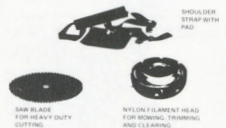
SAW BLADE FOR HEAVY DUTY CUTTING

DISPLACEMENT — 2.3 cu.in. (38cc) WEIGHT — 14-1/2 Lb. FUEL TANK CAPACITY — 1-1/2 Pt. FUEL MIXTURE — 20:1 CARBURETOR — TILLOTSON HU