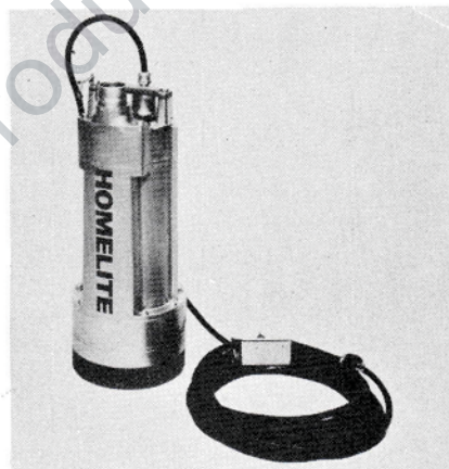
NEW HOMELITE submersible pump will be featured at Chicago Conexpo '75 in February.

Homelite is one of the world's largest producers of chain saws and a leading manufacturer and distributor of construction and lawn and garden equipment.